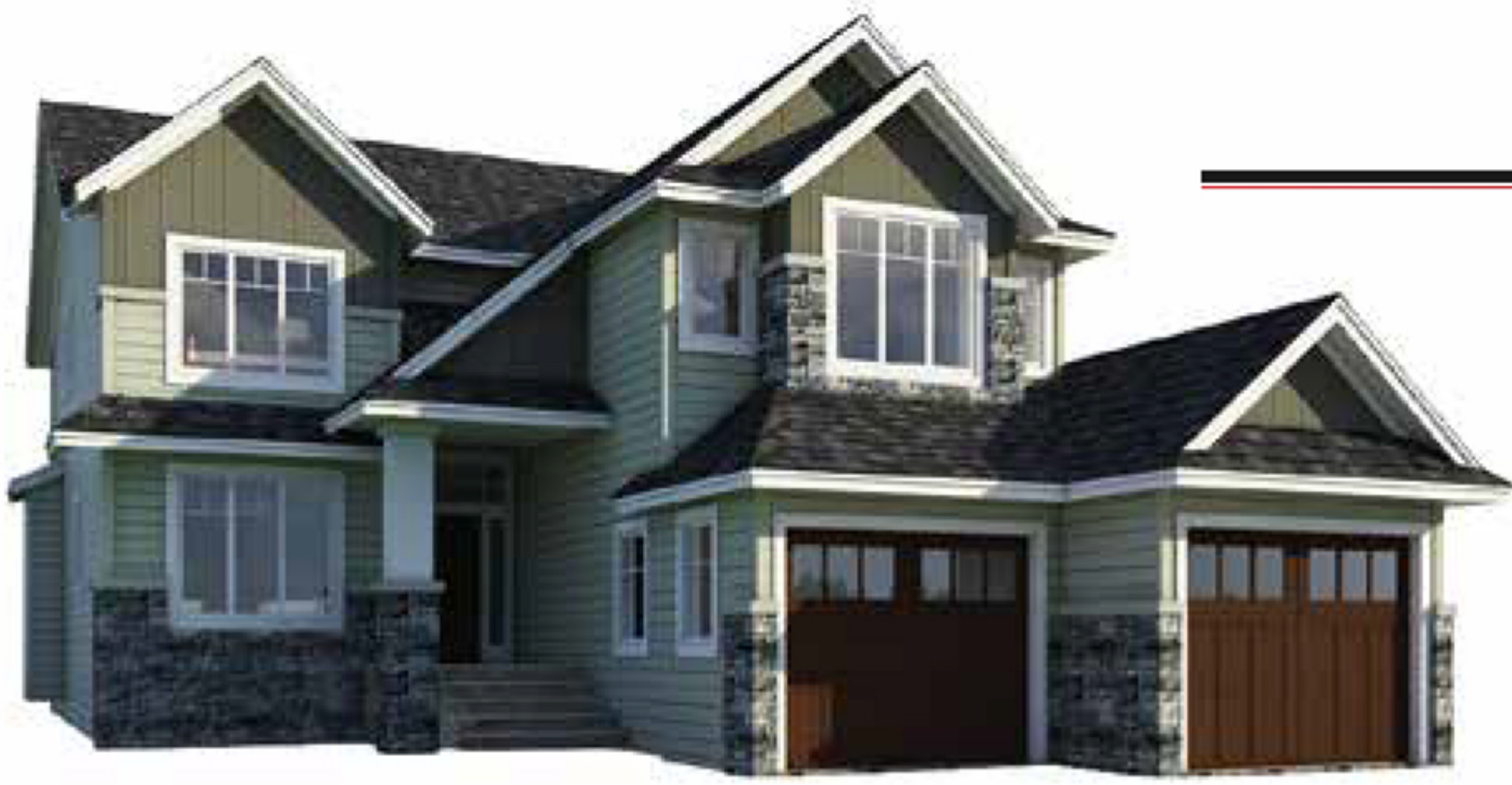
KAITLYN II 2,859 sq. ft.